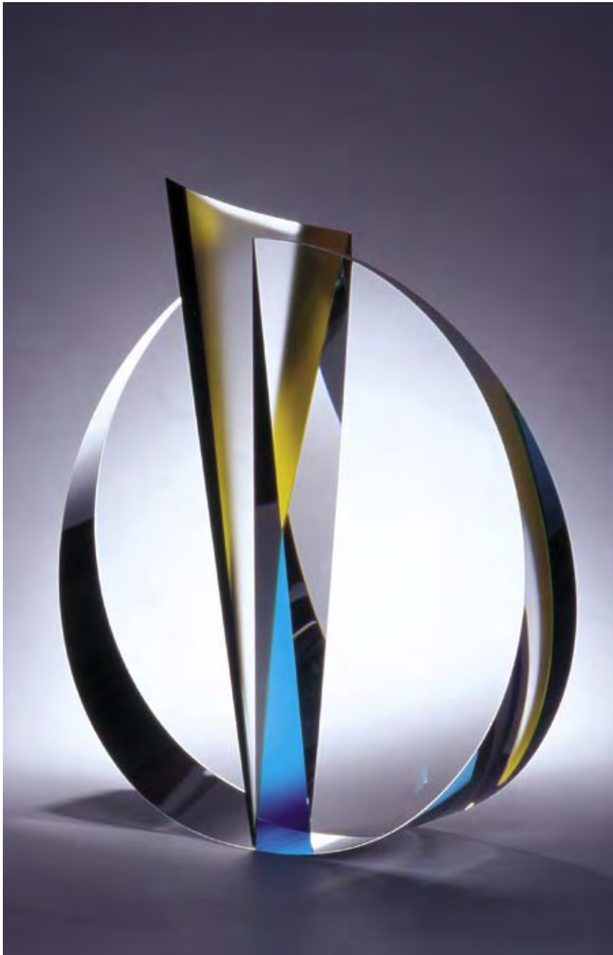
Bird of Paradise Cut, polished and laminated optical glass - 15 x 13 x 4.5"