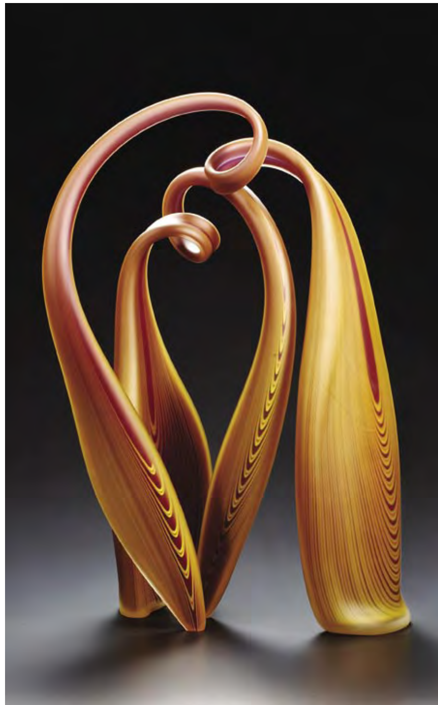
Bowing Pair Chocolate/Sand 23" high - Blown, hot sculpted and acid etched glass