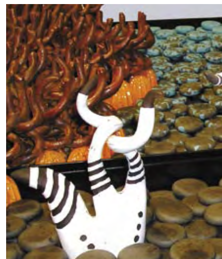
Fantasy 64 x 30 x 10" - Blown and sculpted glass, fused steel