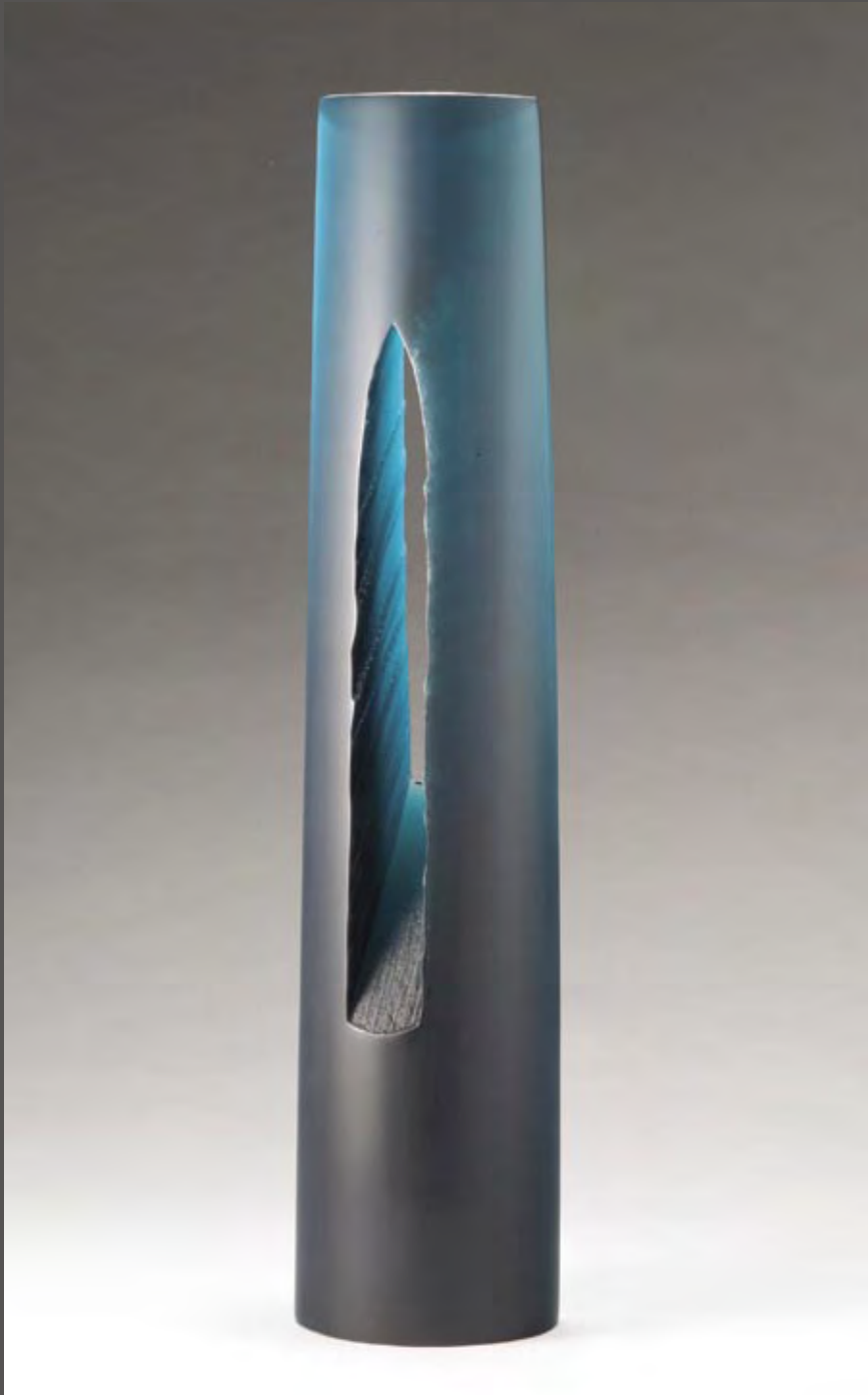
Hope Kiln cast glass - 30.5 x 6.625 x 4.75"