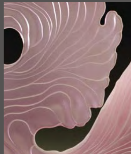
Pale Pink Seafan 11 x 20 x 19" - Blown, sandcarved and slumped glass