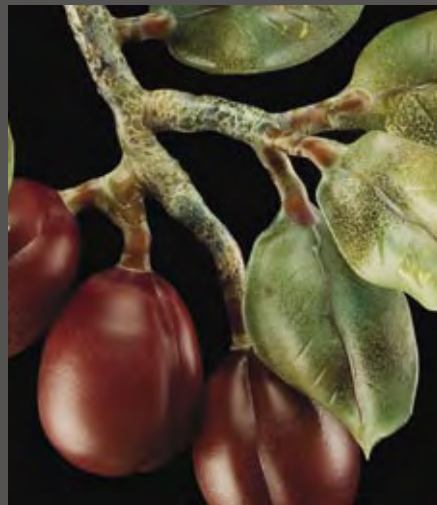
Botanica: Plum Branch Flameworked and sandblasted glass - 20 x 29 x 6"