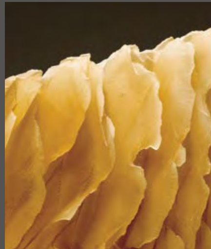
Small Amber Mountain 15 x 12.5 x 1.5"- Cast and cut glass, fused steel