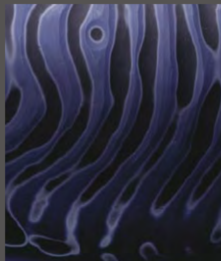
Yonder Strata 9 x 17 x 8" - blown and carved glass