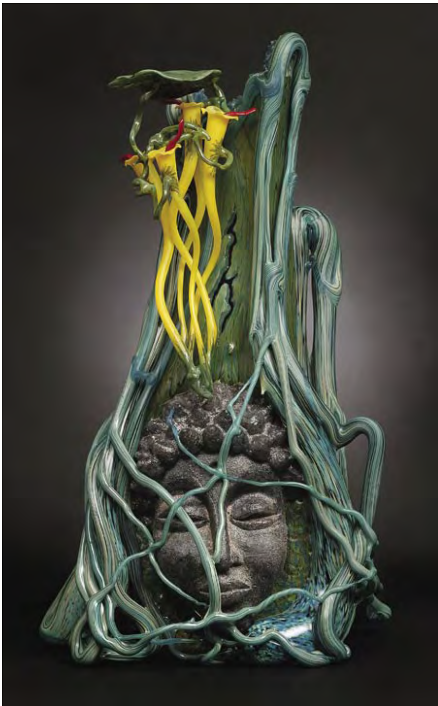
Song of The Enlightened Buddha Blown, cast and flameworked glass - 18 x 6 x 6"