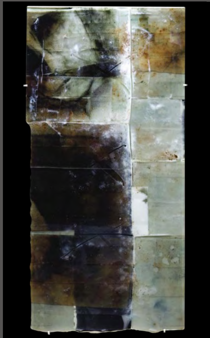
Her Face Cast A Shadow 34 x 17 x 1" - Kilnformed glass