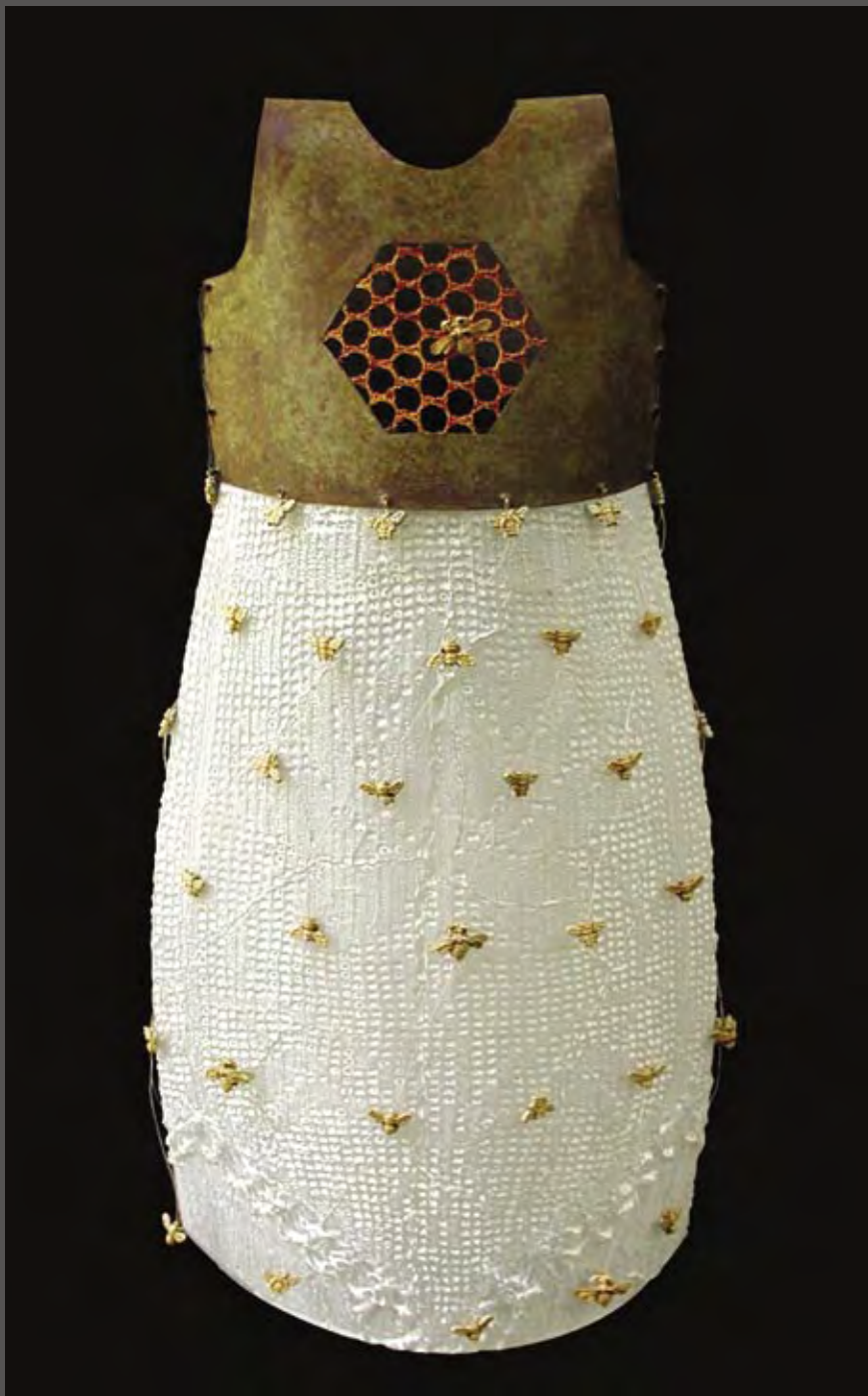
Bee Line Cast Glass and Mxed Media - 18 x 10 x 7"