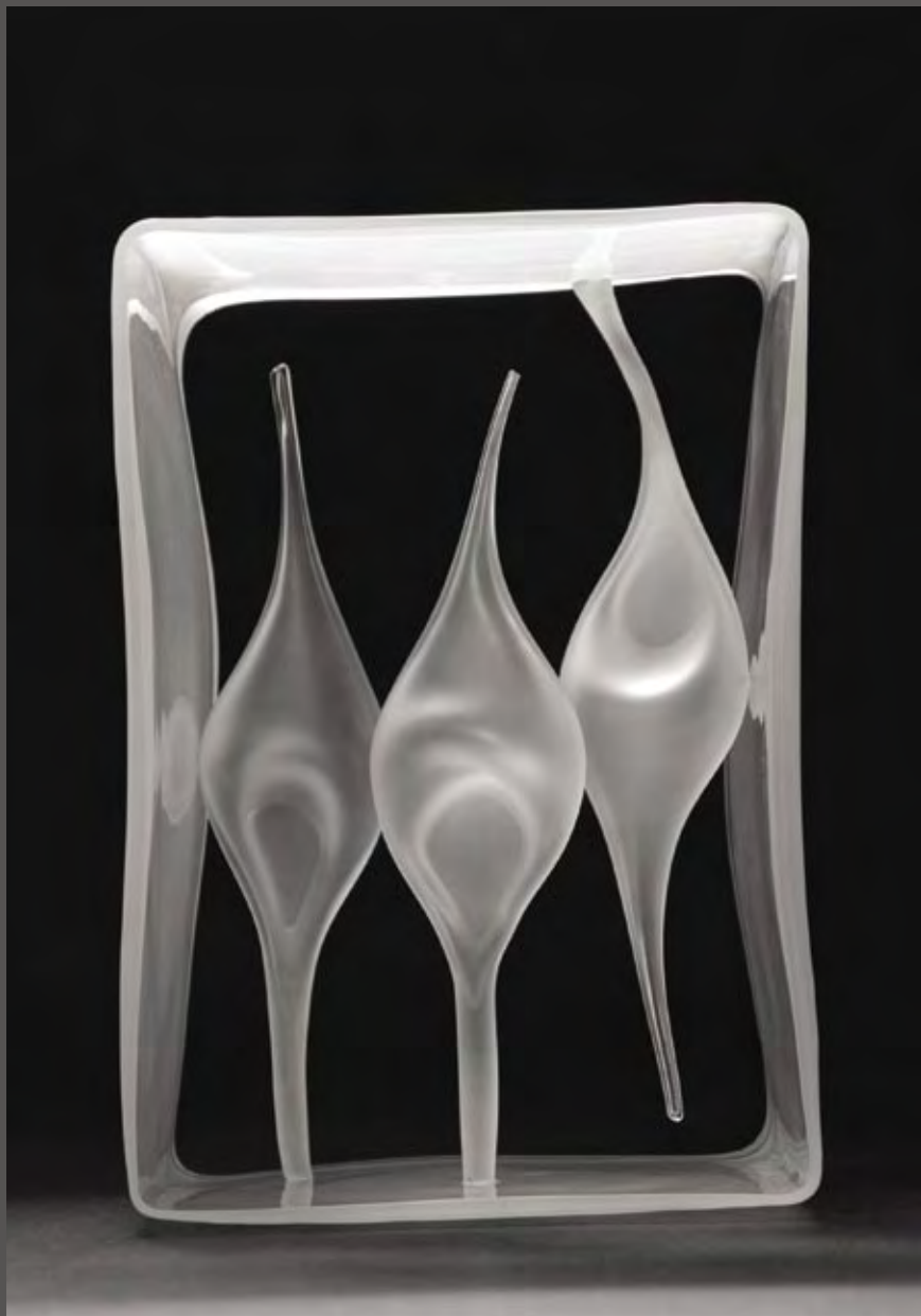
Leaves Blown Glass, sandblasted, fire polished and assembled - 6 x 9 x 3"