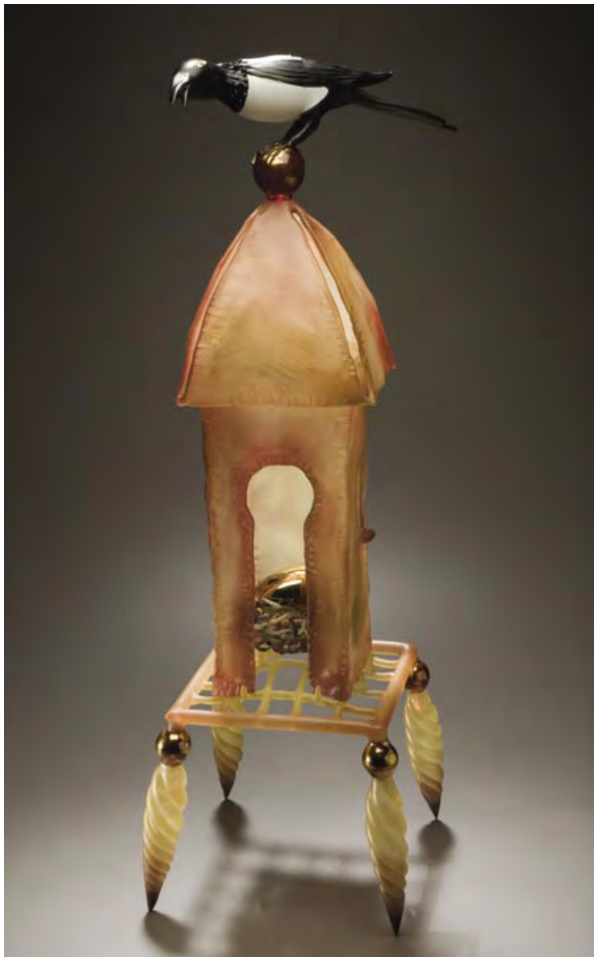
Fulfilled In Sight Flameworked glass - 28 x 9 x 9"