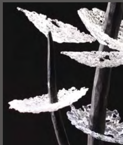
Winter Night 34 x 34 x 5" - pate de verre and fabricated steel