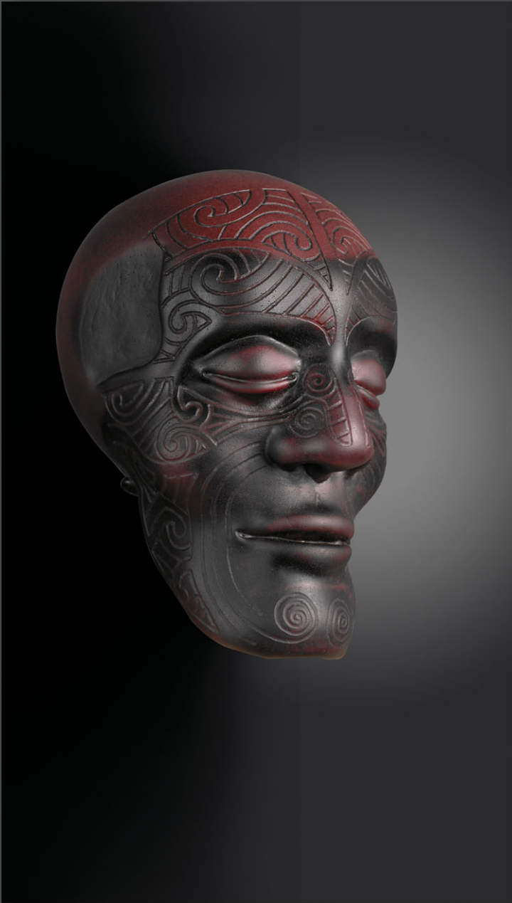
old taonga - Blown, sculpted and hand carved glass with wood and fiber - 9 X 12 X 7.5"