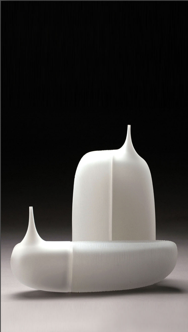
lambent - blown glass, wheel cut, sandblasted, acid etched - 12 x 7 x 12"