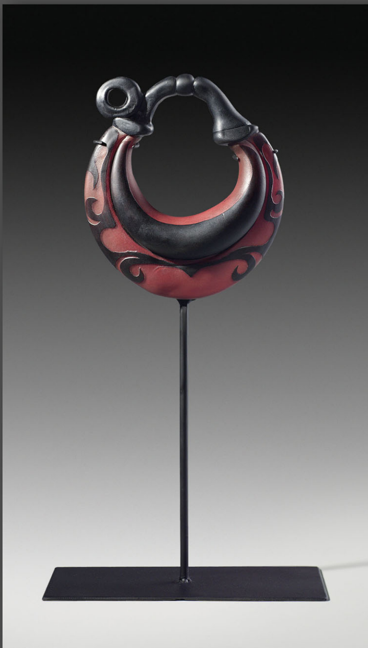
bridal #1 - hot sculpted glass, steel stand - 12 x 7 x 6"